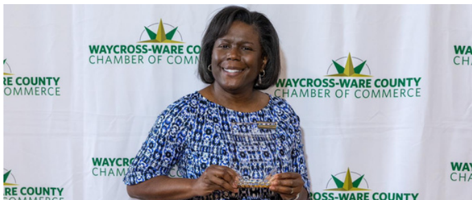
Katherine Foss Education Award