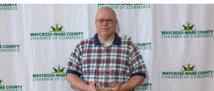
Jack Williams Community Service Award