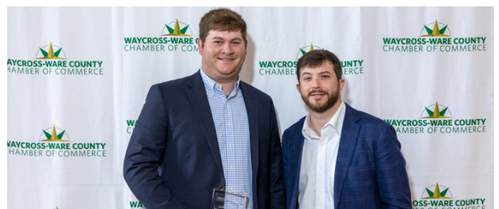
McGregor Mayor Agricultural Award