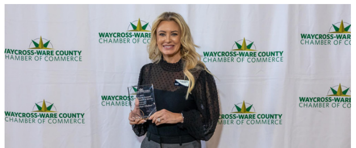
A.A. Karle Award