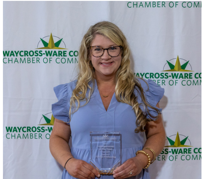
Entrepreneur of the Year