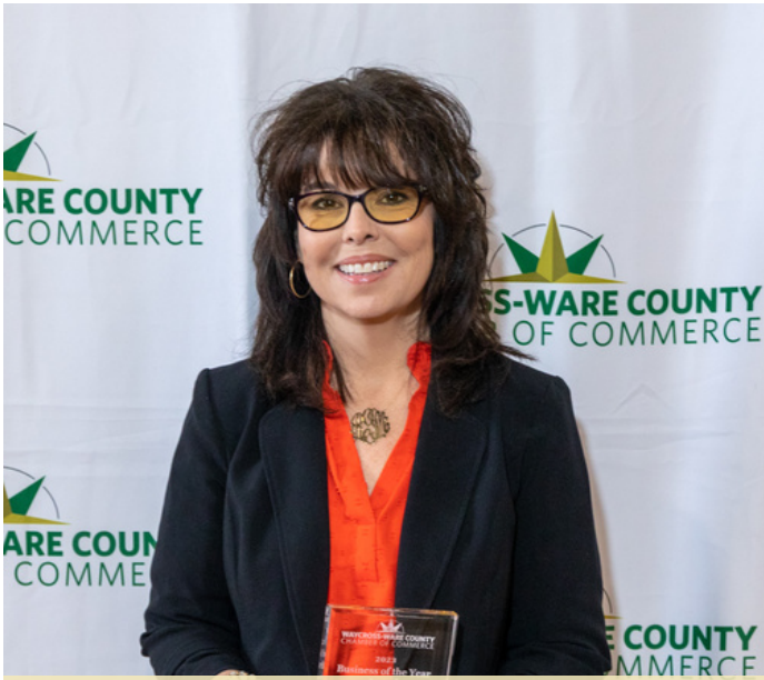
Business of the Year