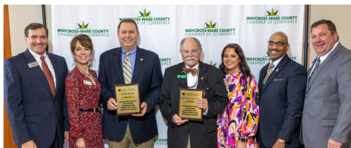
Outgoing WWDA Board Members