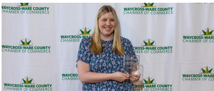
Ambassador of the Year