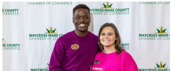
Helping Hands Award