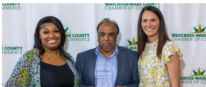
Ralph & PO Herrin Business & Industry Award