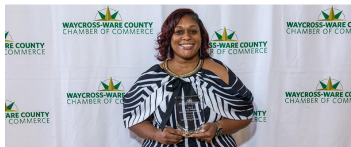
Randy Sharpe Health Hero Award