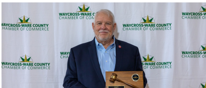
Outgoing Chamber Chairman